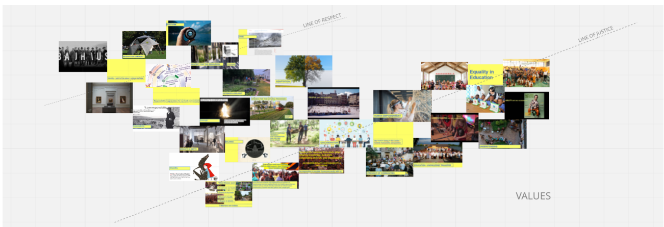
Figure 1: The NEB Values Framework derived from mapping the fundamental values highlighted by HLRT members during the first experimental collaborative Pecha Kucha presentation.

We evolved this format further to solve our challenges specifically for an online co-creation environment. Instead of 20 slides delivered by one person, each of the 18 members of the HLRT was tasked to deliver 3 concepts with great clarity in just 1 minute. This resulted in up to 54 ideas delivered in just 18 minutes (the length of a TED talk) with equal contribution by each member. The resulting collection of idea visuals was then mapped on the Miro board according to their conceptual, visual and semantic links.